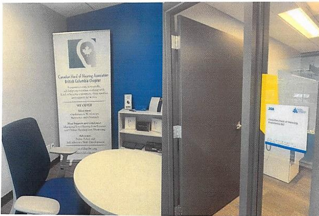
New offices at the Wavefront Centre for Communication Accessibility in Vancouver